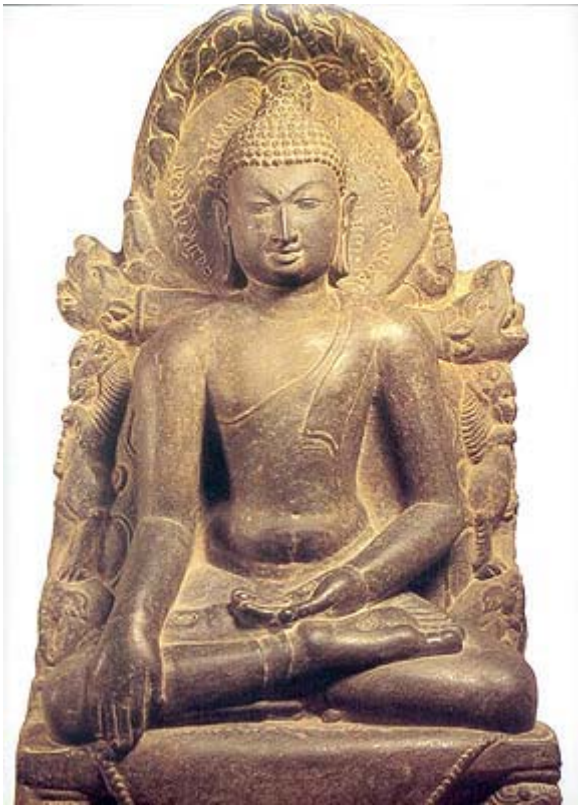
Buddha Calling Upon Mother Earth to Bear Witness Pala, Bengal, circa A.D. 11th century Stone, 56 X 32.5 X 17.5 cm

The Pala patronage continued for over three hundred years. In the meantime there evolved under them several other centers of Buddhist art, though the images of this subsequent period, rendered both in stone and metals, did not make any significant departure from the earlier tradition. Buddhism was by now the dominant religion of China. In tune with its local tradition, China added to Buddha image the grandeur and magnificence befitting an emperor as also its dragon like traditional motifs. This Chinese influence came back to India and defined Buddha images of the subsequent Pala period. These images show exceptional interest in dragon type Chinese motifs and other decorative elements.