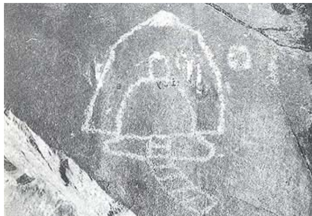
Dated carvings of 1st century B.C. from Chilla II

while in the other, the stupa itself has been carved in anthropomorphic dimensions giving the impression of a human being.