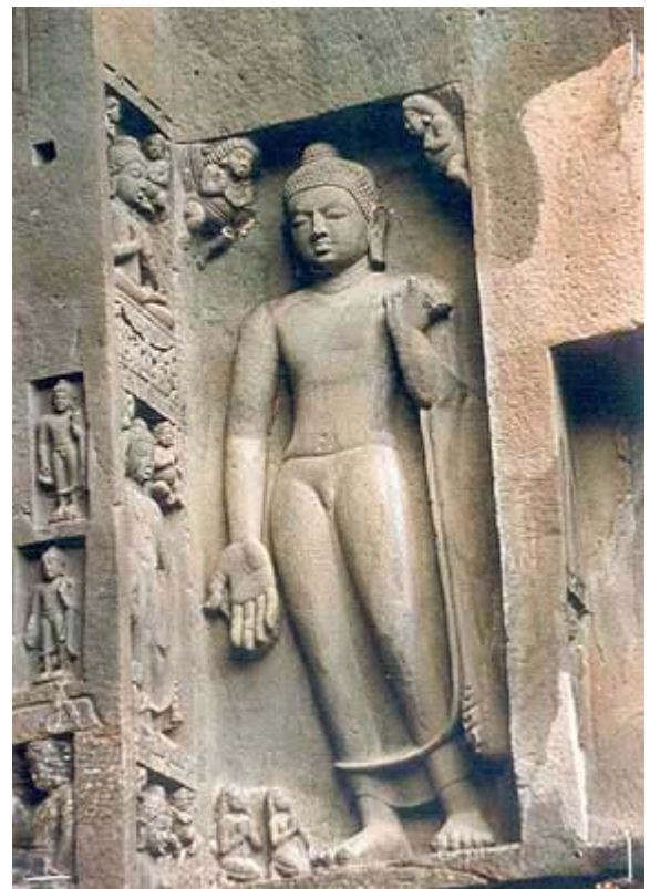
Buddha image from Ajanta. A simpler iconography

They little incline to be robust or heroic in their over all build. There emerged in their physiognomy a kind of feminism or the tenderness of a prince rather than the toughness of a monk.