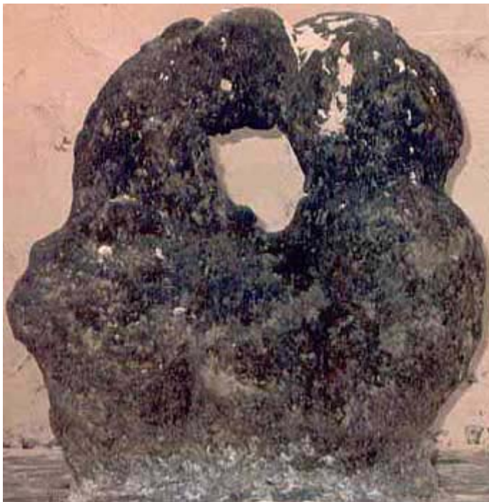
A natural stone-piece. The loving couple.

As suggests anthropological evidence, man had discovered his first image during Neolithic days itself (12000 - 8000 BC). It seems, the helpless primitive inhabitant, suffering at the hands of invisible forces, which he found beyond his control, looked for an alike invisible guardian, a thing divine, to protect him from the ire of these forces. The questing mind perceived in a stone boulder, which revealed 'a face' or a 'likeness', the 'image' of this 'invisible protector'. This stone-piece, shaped to a likeness by nature's chiseling, was perhaps the ever first image. The primitive mind accepted it sometimes as it was and sometimes after sculpting it to a more accurate form and figure.