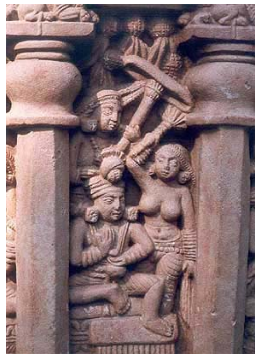
Sanchi. Bas-relief with sculptural multi-dimensionality. (2nd - 1st century B.C)

It is true that the early Indian art, which was by and large thematic in its rendition, found in the bas-relief technique a more suitable art-mode for depicting or serializing a running theme, but it is not true that it did not have sculptural art. These reliefs themselves were sculpted deep enough to acquire dimensions of sculptural art.