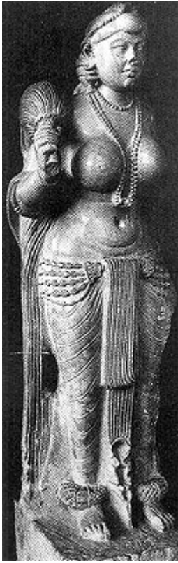
Didarganj Yakshi from 3rd/ 2nd century B.C

The Yaksha and Yakshi statues from the 4th, 3rd and 2nd century B.C. are examples of a well evolved and elaborate sculptural art to have prevailed in India long before she had any links with Persian and Greek worlds.