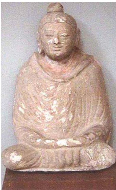
Buddha Image (Stucco) from Mathura. 1st century A.D

The obverse side has figures of Kanishka himself. Buddha's stucco images are also reported from around the same 1st century A.D. The stucco image of the Buddha, in the collection of Mathura Museum, belongs stylistically to the same iconic group to which the A.D. 81 Buddha image belongs.