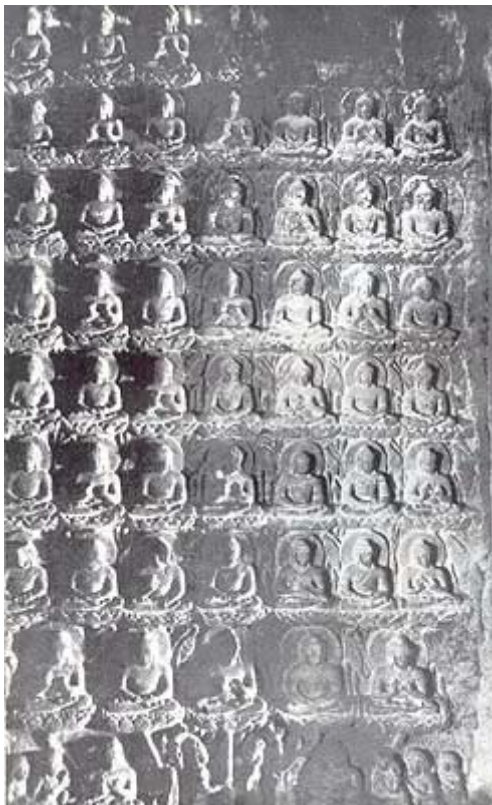
The Thousand Buddhas (Ajanta Cave 7)

The Buddha image, which completely revolutionalised, by its great dynamism, unimaginably diversified iconography, massive scale and unique spiritualism, the art scenario in ancient India, seems to have evolved upon human mind during the lifetime of the Buddha himself, although this image of mind took some six hundred years to emerge into stone or clay like mediums. As the Buddhist tradition has it, even during Buddha's lifetime, the idea of making his images persisted in his devotees' minds. The widely quoted legend of king Udayana, commissioning Buddha's image to represent the Great Master during his absence and that of Anathapindaka praying Buddha to allow at least the images of Bodhisattvas, suggest that his followers contemplated the possibility of covering their Master's absence by his anthropomorphic representations even before the Mahaparinirvana.