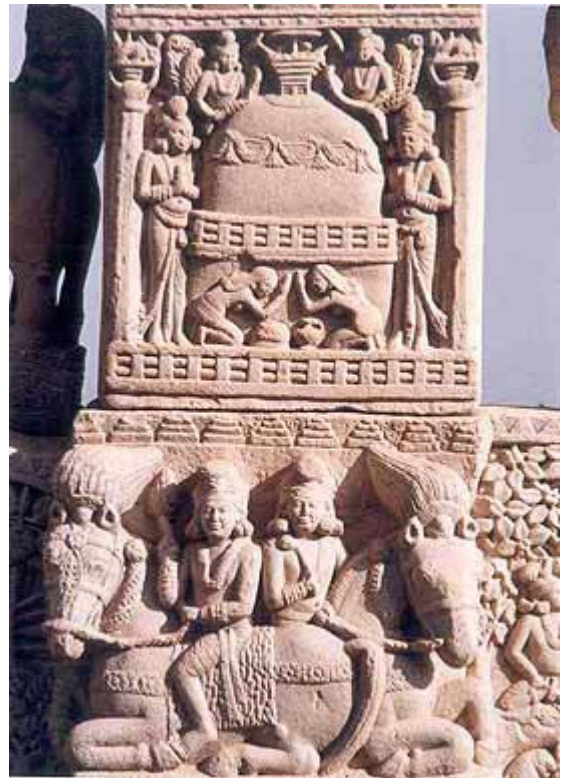
The presence of Buddha realised in Stupa. The Shunga art idiom.

Rulers of the Shunga dynasty (pre Christian era) were more specific. They sought to carve in stone episodes direct from Buddha's life, his teachings, scenes of adoration and other Buddha related themes. Buddha's anthropomorphic representations were, however, evaded. During over three hundred years of such Buddhist art his presence was made felt through a number of things or symbols but he was not directly portrayed.