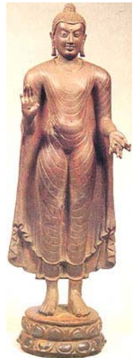
Buddha: A Monk Teacher Pala style, circa A.D. 7th-8th century Nalanda, Bihar, Eastern India Bronze, 27.8 X 8.8 X 6.8 cm

Some two hundred miles ahead of Sarnath, towards its east, as also some two hundred years after Sarnath image of Buddha had evolved, there developed at Nalanda, under Pala rulers (750 - 1185 AD), who were themselves followers of Buddhism, an alike significant center of Buddhism and Buddhist art. Nalanda was a great center of Buddhist learning as well attracting hundreds of Buddha's eager disciples from all over the world to come to Nalanda to study and learn the Law. They wished to carry with them the icons of the Great Master. Hence, the Buddhist image shifted now from stone, stucco or clay to metals - copper, bronze, brass and gilded copper. Stylistically, the Nalanda image of Buddha followed broadly the features of Sarnath, but the figures were now taller and the robe was longer trailing much below the knees. The Nalanda images have slightly open eyes and a more transparent garment.