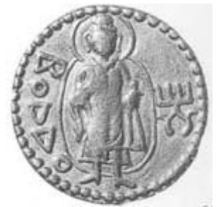
Kanishka Coin (100 B.C.)

The image proper, that is, a fully evolved image with anthropomorphic dimensions, appears around the 1st century A.D. There is, amongst the Buddha statues, reported from Mathura, a dated one of A.D. 81. Some of the gold and copper coins of Kanishka, who ruled from 78 A.D. onward, have Buddha images on their reverse.