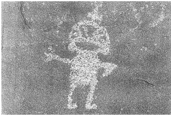
Dated carvings of 1st century B.C. from Chilla II

The first century B.C. marks the transition in Buddhist art from its non-visible to the visible image phase. Excavations at Chilla II (now in Pakistan) betray dated carvings of the 1st century B.C., which may be the earliest attempts at discovering Buddha's anthropomorphic image. In one of these carvings a stupa-form comprises figure's head,