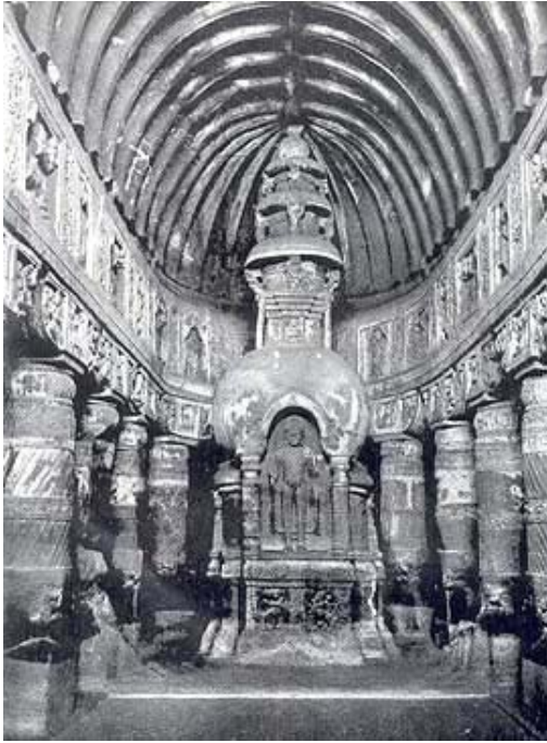
Ajanta Cave 19

Ajanta caves and those at Pitalkhora, Kanheri, Bhaja, Karla etceteras powerfully depict this transition. The 2nd century B.C. caves have simply a stupa, without any kind of Buddha's anthropomorphic representations, enshrining them, whereas in the subsequent caves carved in the 1st century B.C. such stupa has Buddha's icons in its niches on all four sides.