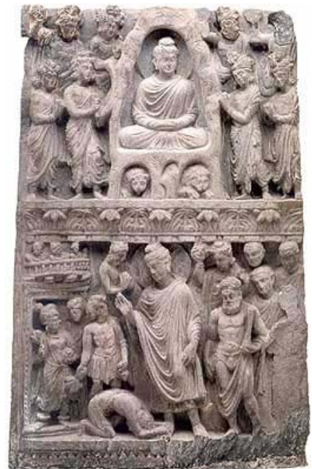
Relief with scenes from the Buddha's life showing clear Greek influence. Pakistan (ancient Gandhara); 2nd/3rd cen. Gray schist; 60 X 37.1 X 7.3 cm (235/8 X 145/8 X 27/8 in.)

Thus, it is obvious that Mathura image of Buddha, irrespective of whether it preceded Gandhara image or the Gandhara image preceded it, is an independent and full fledged genre grown out of indigenous tradition and by sharing elements of Greek art reaching it through its Kushana rulers. The two types have some elements in common but the points of departure are no less. Gandhara images of Buddha are more akin to Greek models, whereas Mathura images show a continuity of its own indigenous tradition.