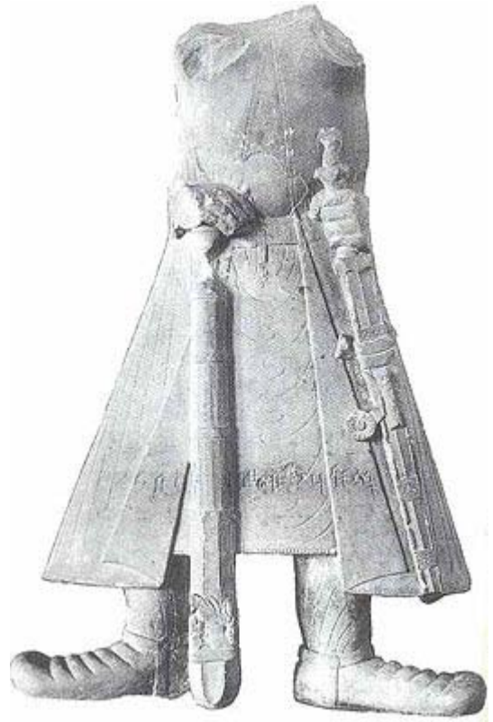
Headless dated statue of Kaniska. Mathura, The dated portrait statues of the Kushan royalty enable dating of undated Kushan Buddha and bodhisattva images. They also provide evidence of the impulse in the anthro-pomorphization of the Buddha.

As regards the modeling of the Buddha image, these scholars assert its non-Indian origin. They emphasize that monks in ancient India wore hardly any or only minimum cloth. Hence, Buddha's voluminous drapery with heavy pleats, an imitation of Roman toga, is non-Indian. A hero-like heavily built physique does not befit an Indian monk. Buddha is known to have shaven off his hair. Obviously the Buddha image, modeled with matted hair (jatamukuta), is only an imitation of Greek models. And, finally, figure's aesthetic beauty is characteristic to Greek art. The art of