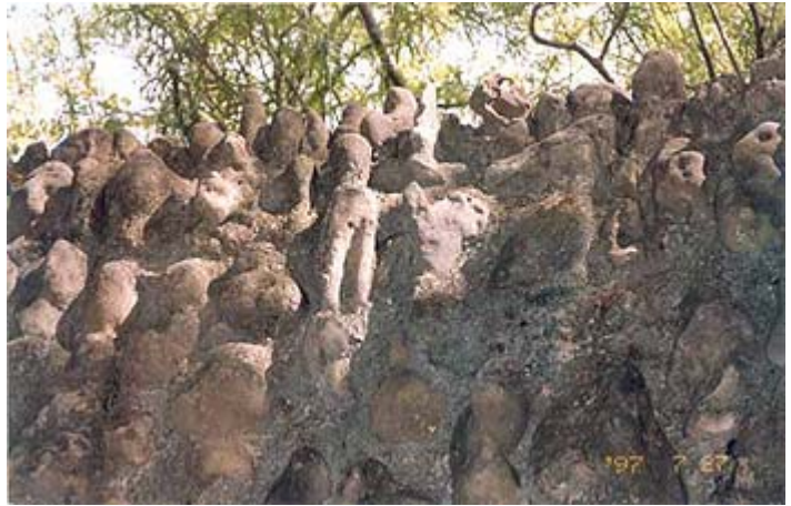
A heap of boulders processed by nature to human likeness. Attending the sermon.

It should be remembered that, howsoever thin, there is a dividing line between making an image and discovering or conceiving it. It seems that the first ever image defined by humanity was not a thing chiseled to a likeness, but such likeness was only discovered in it, that is, it was by sheer appearance that the ever first image emerged and occupied man's altar and mind.