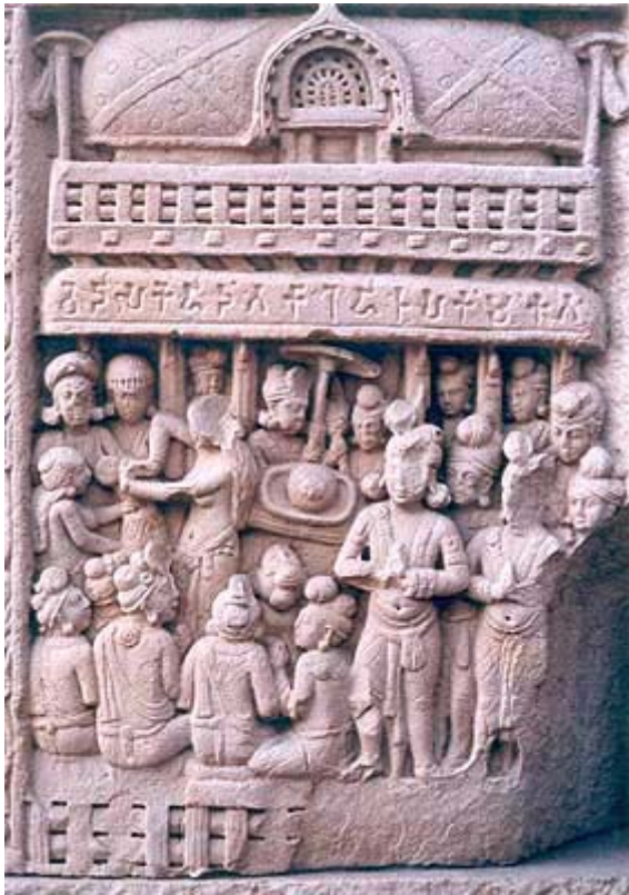
Sanchi. Worship of headdress. A fully evolved iconography in pre-image phase of Buddhist art. (2nd - 1st century B.C)

Mathura inherited these features from Gandhara for its Buddha image. It hence represents a phase of Buddha image subsequent to Gandhara.